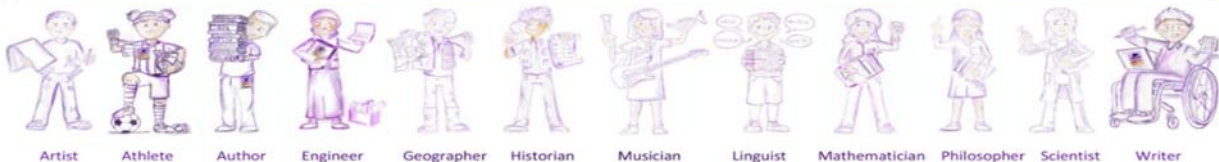
Artist Athlete Author Engineer Geographer Historian Musician Linguist Mathematician Philosopher Scientist Writer